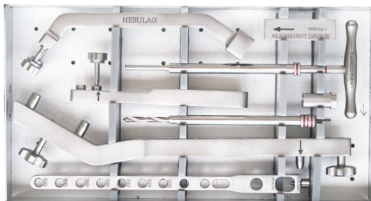
BOX FOR M.R.F.N. PROXIMAL JIG SET