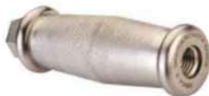
Depth Gauge Long