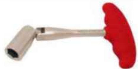
T - Handle (Wrench)