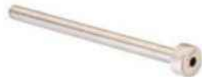
Drill Sleeve for 4.5 MM Drill Bit