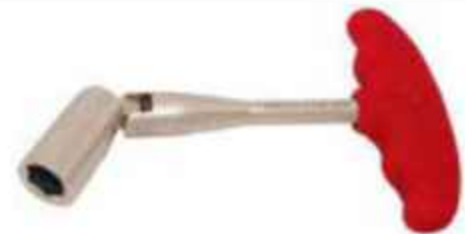
T - Handle (Wrench)