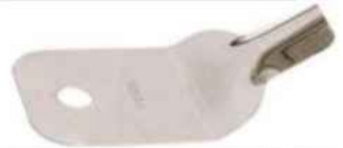
Proximal Reamer For Humerus