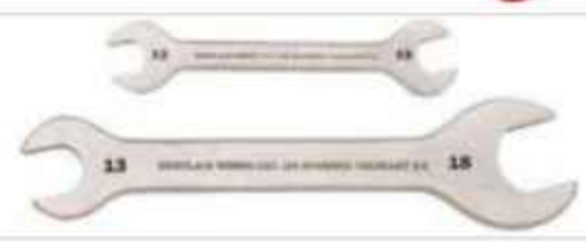
Spanner (Ordinary) 12 X 13 , 18 X 13