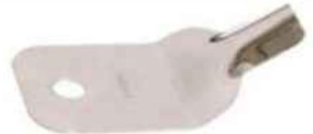
Proximal Reamer 13 MM