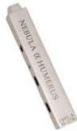
Aiming Arm For Humerus Nail