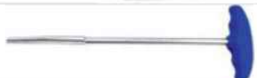
Screw Driver 4.5 X 250 MM