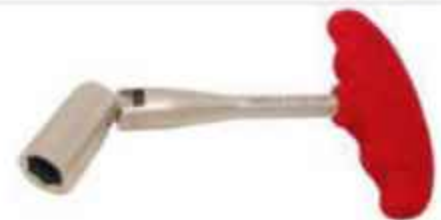
Spanner (Ordinary) 12 X 13, 18 X 13