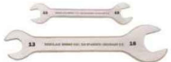
Spanner (Ordinary) 12 X 13, 18 X 13