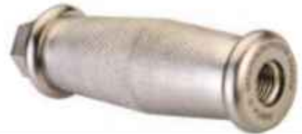
Impactor / Extractor Handle