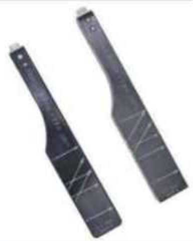
Aiming Arm For P.F.N / T.F.N Nail 130° Aiming Arm For P.F.N / T.F.N Nail 135°