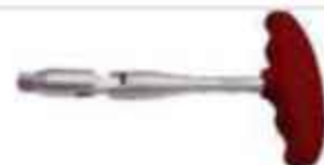
T-Handle for Conical Bolt