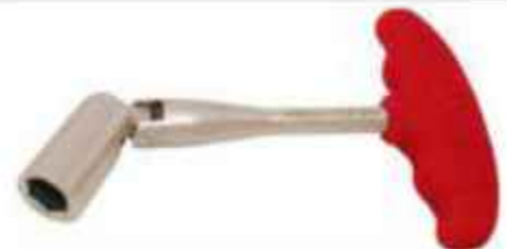
Spanner (Ordinary) 12 X 13 , 18 X 13