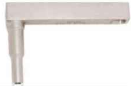
Jig For Humerus Nail