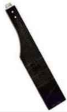
Aiming Arm For Multifunction Tibia Nail