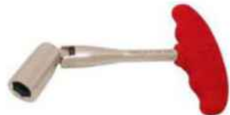
Spanner (Ordinary) 12 X 13, 18 X 13