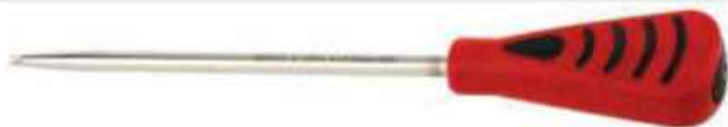
C. C. Screw Driver 5.0 X 250 MM