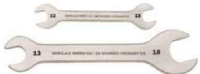
Spanner (Ordinary) 12 X 13, 18 X 13