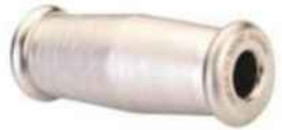
Impactor / Extractor Handle