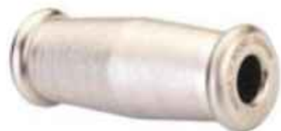
Impactor / Extractor Handle