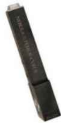
Aiming Arm For Cyrus Femur Nail