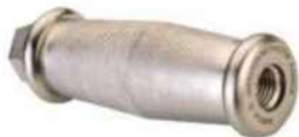
Introducer Hammer Unit