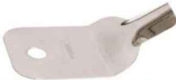
Proximal Reamer 13 MM