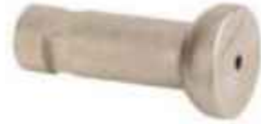
Depth Gauge Long