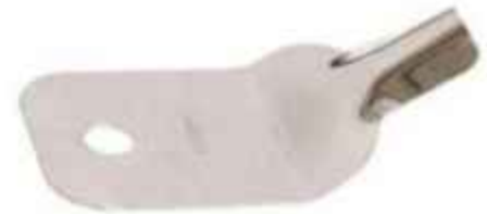
Proximal Reamer 11 MM