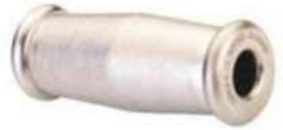
Impactor / Extractor Handle