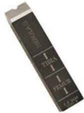
Aiming Arm For Tibia & Femur Nail