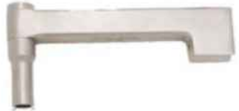
Jig For Tibia & Femur Nail