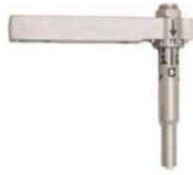
Jig For Multifunction Tibia Nail