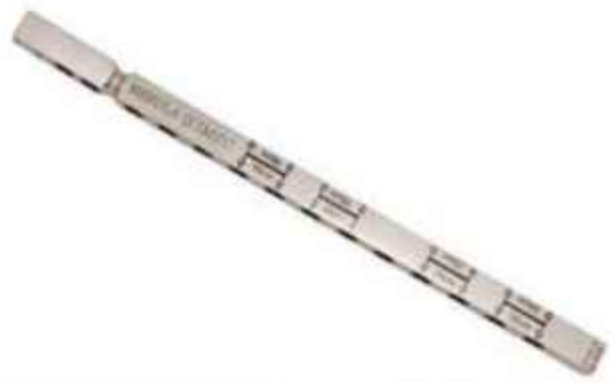
Aiming Arm For I.M.S.C. Nail