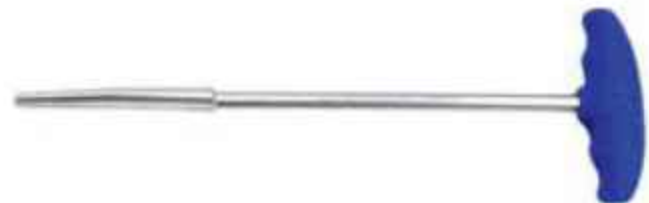
Proximal Reamer 13 MM