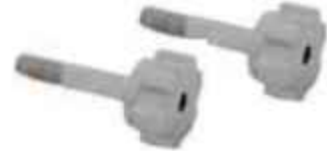
AFN Bolt for Screw Guide Device (2 Nos.)