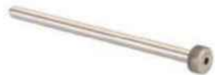
Drill Sleeve for 4.0 MM Drill Bit