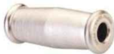
Impactor / Extractor Handle