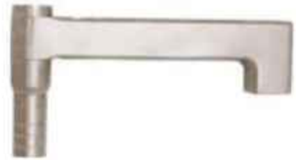
Combine Jig For P.F.N / T.F.N Nail 130° & 135°