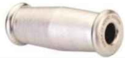
Impactor / Extractor Handle