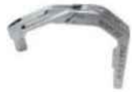
Main Jig For A.F.N