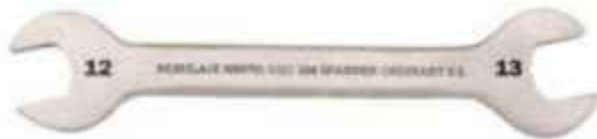
Spanner (Ordinary) 12 X 13