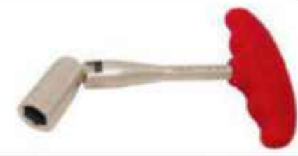
T - Handle (Wrench)