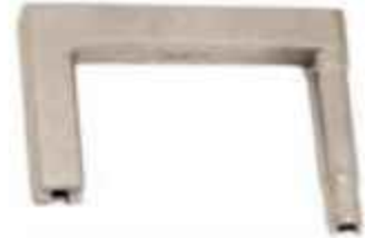
Jig For I.M.S.C. Nail