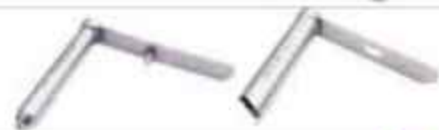
Protection & Guide Sleeve 17 MM