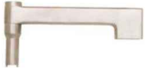
Jig For Cyrus Femur Nail