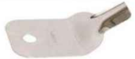
Proximal Reamer 13 MM