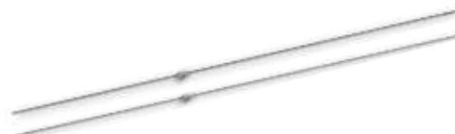
Cat. 221 OLIVE WIRE (BINET & TROCER SEAMLESS TYPE)