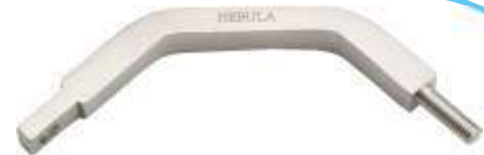
Cat. 215 OBLIQUE SUPPORT