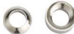
Cat. 222.003 WASHER (CONICAL COUPLE)