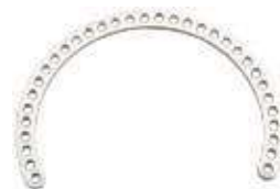
Cat. 209 5/8 RING