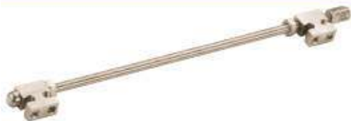
Cat. 206.007 Length : 150 mm , 200 mm , 250 mm , 300 mm FISH MOUTH DISTRACTOR