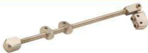
Cat. 206.008 Length : 50 X 75 mm PIP DISTRACTOR