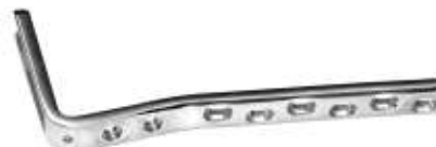
Cat. 114 Hole : 05 To 16 95° ANGLE BLADE PLATE (D.C. HOLE) Blade Length :60 mm To 80 mm