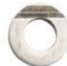
Cat. 222.002 WASHER (SLOTTED)