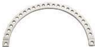
Cat. 207 HALF RING