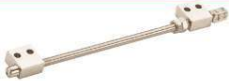
Cat. 206.006.B Length : 150 mm , 200 mm , 250 mm , 300 mm DOUBLE PIN DISTRACTOR (M6)