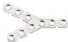
Cat. 136 SHERMAN Y PLATE

Hole : ( 3 X 3 X 3 To 3 X 3 X 10 ) ( 4 X 4 X 4 To 4 X 4 X 10 )