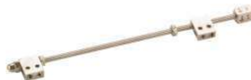
Cat. 206.006 Length : 100 mm x 150 mm 200 mm DOUBLE PIN DISTRACTOR (M4)