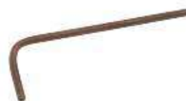
Cat. 206.016 Dia : 2 , 3 mm ALLEN KEY