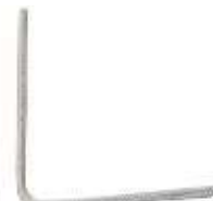
Cat. 206.014 Size : 2.5 mm ( 50 x 50 mm ) LARGE "L" ROD 3.0 mm ( 60 x 60 mm ) 4.0 mm ( 90 x 90 mm )