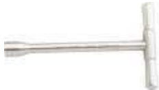
Cat. 225 Length : 8,10,11 mm T-HANDLE SPANNER