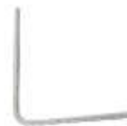
Cat. 206.013 Size : 2.5 mm ( 35 x 35 mm ) SMALL "L" ROD 3.0 mm ( 50 x 50 mm ) 4.0 mm ( 75 x 75 mm )