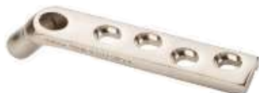
Cat. 111.P Hole : 03 To 06 D.H.S. PEDIATRIC PLATE (D.C.HOLE) A.O. TYPE Angle : 130° To 135°