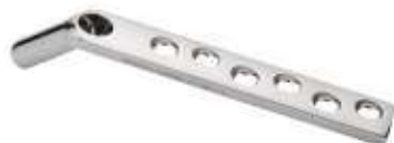
Cat. 111.D Hole : 04 To 06 D.H.S. PEDIATRIC PLATE (D.C.HOLE) A.O. TYPE Angle : 120°