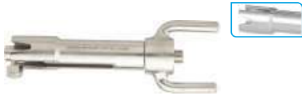
Cat. 223.001 WIRE TENSIONERS (SIMPLE)