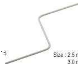
Cat. 206.015 Size : 2.5 mm ( 60 x 45 x 60 mm ) "Z" ROD 3.0 mm ( 80 x 50 x 80 mm ) 4.0 mm ( 100 x 60 x 100 mm )