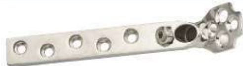
Cat. 112 Hole : 04,05,06 D.H.S. PLATE S.B./L.B. (TROCHANTERIC SUPPORT) ROUND HOLE Angle : 130° To 135°