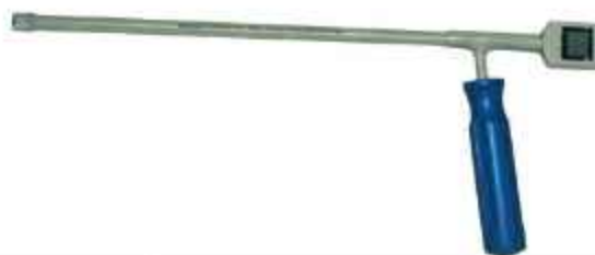
Cat. 3656.S PLIF CAGE INTRODUCER (S. TYPE)