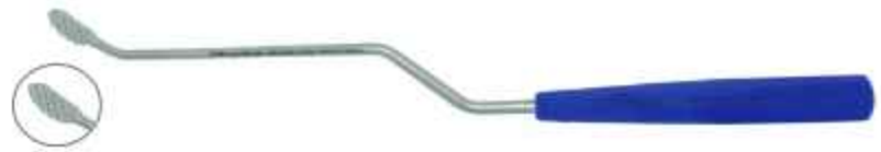
Cat. 3661 KUGEL DISC DISTRACTOR (24 X 06) MM