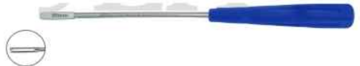
Cat. 3666 T HANDLE Q.C.